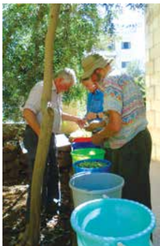
QVA harvesting olives from trees in Meetinghouse garden

Earlier in the year, there were many programs and gatherings. During and after the war on Gaza, the wider Palestinian community was focused on attending to the needs of the people of Gaza, and many conditions made it nearly impossible to resume activities that had earlier