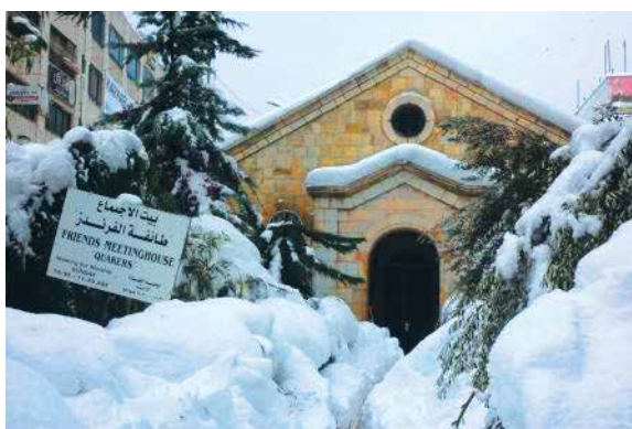
The Meeting House during winter 2014

During 2014, more than fifty international groups have come to the Ramallah Friends