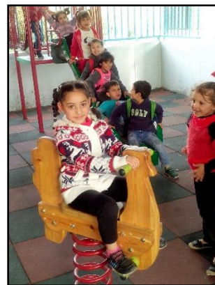
The beautiful children of Amari Play Centre.