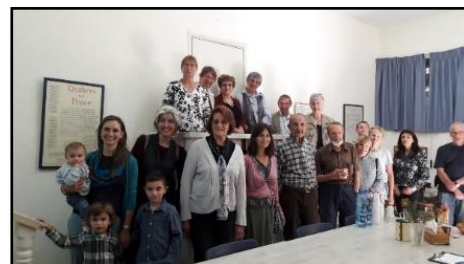
Fellowship following First Day Worship.

Where do we find, over the long haul, the spiritual sustenance required of us? Where are the wells from which to draw living water? How will we meet each season and time, under heaven? Perhaps it is precisely because the situation today is as discouraging and bleak as it is, that our response is more important than at any other time before.