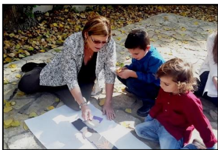
Children engaged in "Godly Play" with members of the worshipping community on patio of RFM Center.

"That which is, already has been; that which is to be, already is; and God seeks out what has gone by." (3:15)