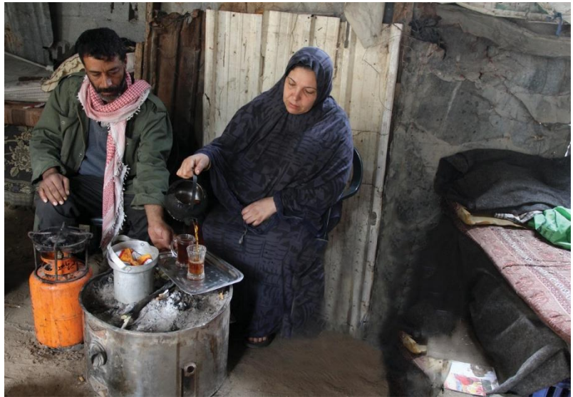
Daily life in Gaza today.

We invite you to join us in making a donation for Gaza relief that will be put to use immediately. This will be accomplished through collaboration with the United Palestinian Appeal (UPA) which has an office of 15 staff members as well as partner organizations on the ground in Gaza. These include hospitals, schools, mental health clinics and healthcare providers. One such partner is Al-Asda Hospital, which has treated over one third of the casualties in the northern Gaza Strip since the demonstrations began on March 30th.