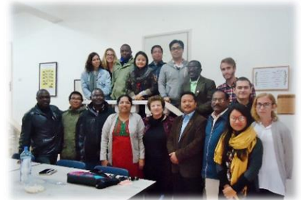
International scholars from the Swedish Theological Institute in Jerusalem visit the Meeting.